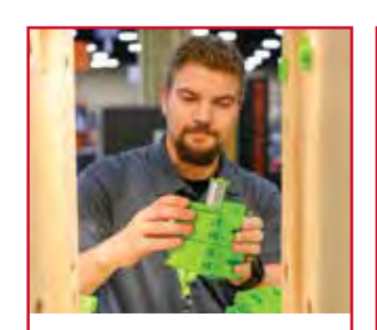
1000s of products and innovations

The NECA Show will prepare you for the future of the electrical construction industry. You'll find a wide range of free education on the trade show floor with sessions on everything from leadership to growing your business to the latest innovations. Learn from the experts, see and touch the newest products and services and plan for tomorrow. This is the place to learn how electrical professional's work is changing.