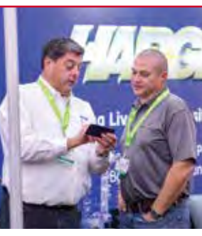
100s of industry experts