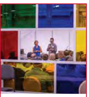
30+ opportunities for learning